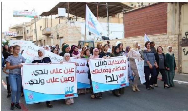
Women in Tour'an march against election-related violence.

In advance of the 2018 local elections, The Abraham Initiatives launched an extensive campaign for "violence-free local elections" in Arab society. The campaign included a charter for "violence-free elections" circulated in partnership with the Council of Arab Mayors and signed by local politicians, candidates and leaders, as well as a series of Arabic-language videos ( here with English subtitles ) of activists and children speaking against violence and in favor of fair elections.