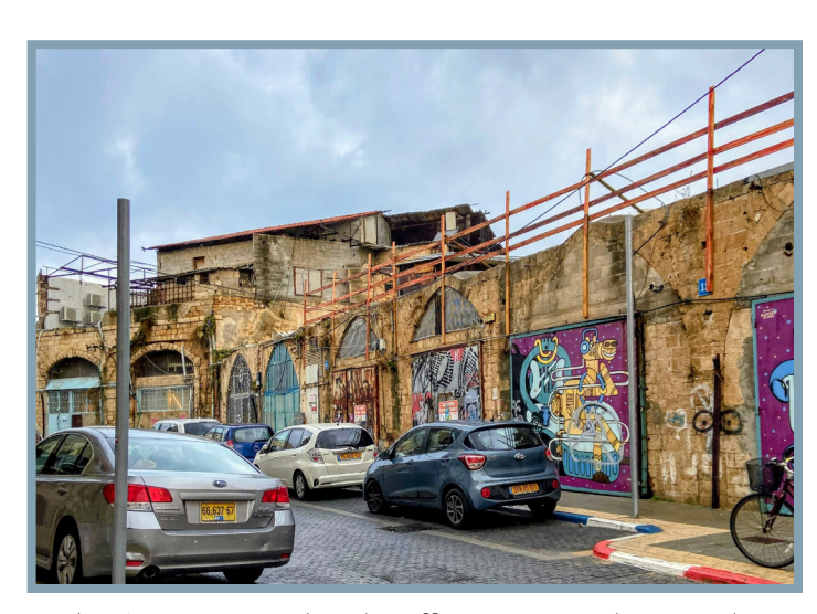
Tel Aviv Street Art (Top), Jaffa Street Art (Bottom)