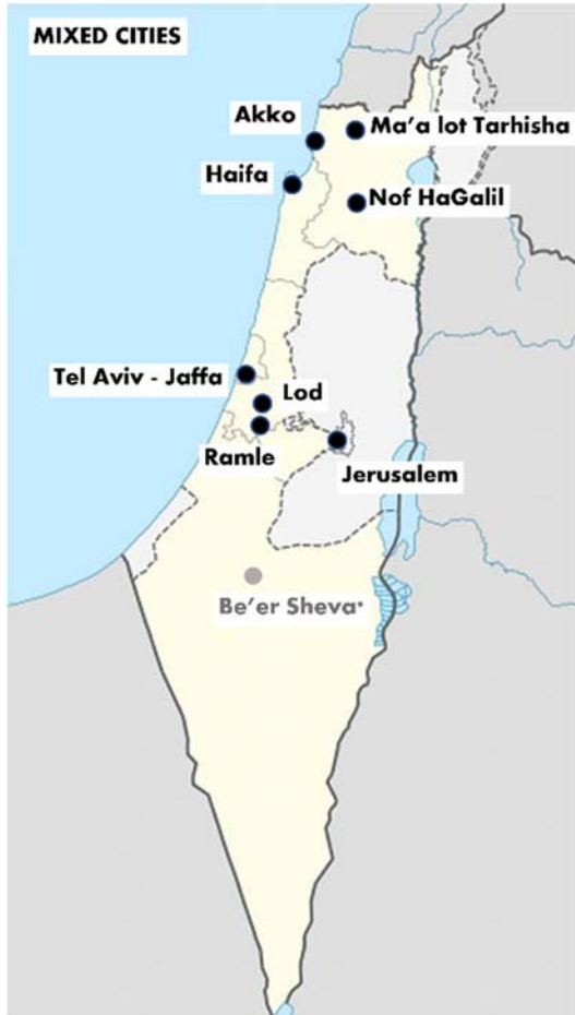
FIGURE 1: Mixed Cities in Israel

mixed but, like Be'er Sheva, are a metropolitan center for a large Arab community, and Carmiel, that have a steadily growing Arab population.